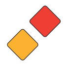
Type N (CA)